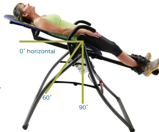
Figure 15 Balanced Correctly: Main Shaft lifts slightly off Crossbar

Your Main Shaft setting should remain the same as long as you continue to use the same Roller Hinge setting and your weight does not fluctuate substantially. If you change your Roller Hinge setting, you should test your balance and control again.