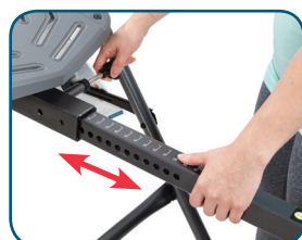
Figure 7 Labeled ① Set Height right on the equipment!