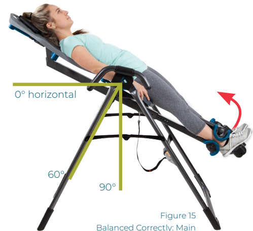
Figure 15 Balanced Correctly: Main Shaft lifts slightly off Crossbar

Your Main Shaft setting should remain the same as long as you continue to use the same Roller Hinge setting and your weight does not fluctuate substantially. If you change your Roller Hinge setting, you should test your balance and control again.