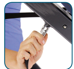
Figure 8 Labeled ② Set Angle right on the equipment!