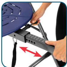
Figure 7 Labeled ① Set Height right on the equipment!