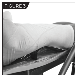
Your inversion table may differ from image shown. Assembly and use of the Lumbar Bridge remains the same.