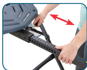
Figure 7 Labeled ① Set Height right on the equipment!