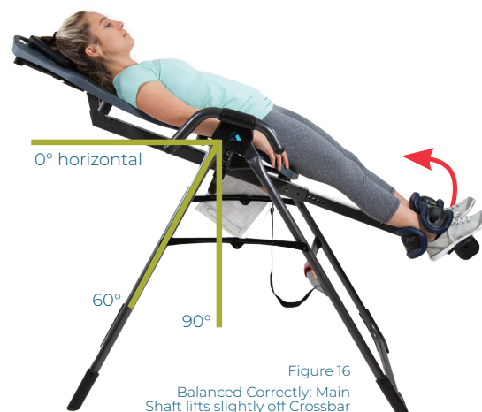
Figure 16 Balanced Correctly: Main Shaft lifts slightly off Crossbar

Your Main Shaft setting should remain the same as long as you continue to use the same Roller Hinge setting and your weight does not fluctuate substantially. If you change your Roller Hinge setting, you should test your balance and control again.