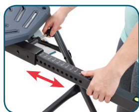
Figure 7 Labeled ① Set Height right on the equipment!